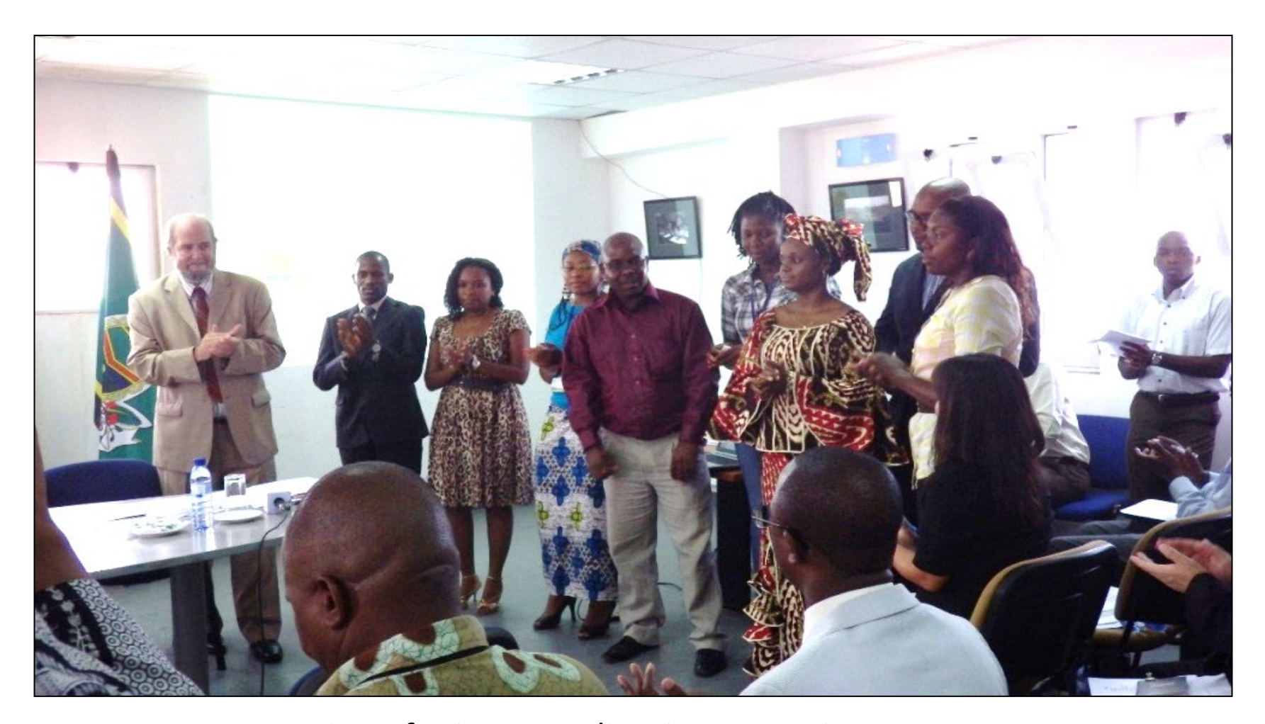
1st Meeting of Joint Coordination Committee at DMSC, 2013