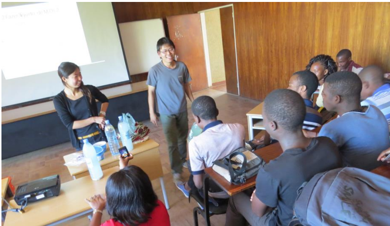
Workshop on Composting by JOCV (Mozambique)

* Japan Overseas Cooperation Volunteers (JOVC) : young professional volunteer dispatched by JICA, that is assigned to developing countries for 2 years to live with local communities