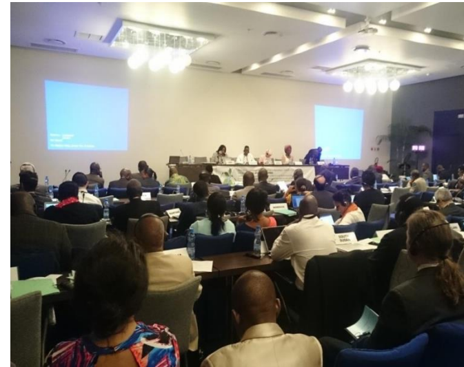
16th AMCEN in Libreville, Gabon