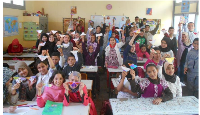
Awareness Activity in school by JOCV (Morocco)