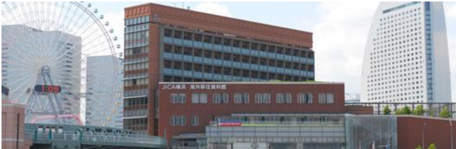
JICA Yokohama (main venue)