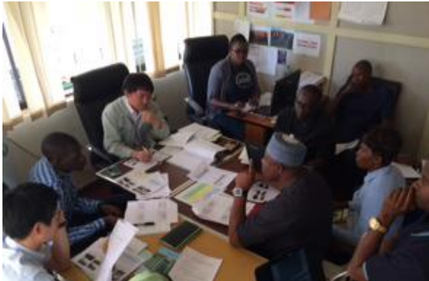
Workshop on Pilot Study in Abuja