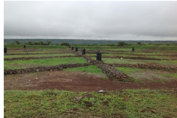
Kang'oki Semi-Aerobic Landfill in Kiambu, Kenya