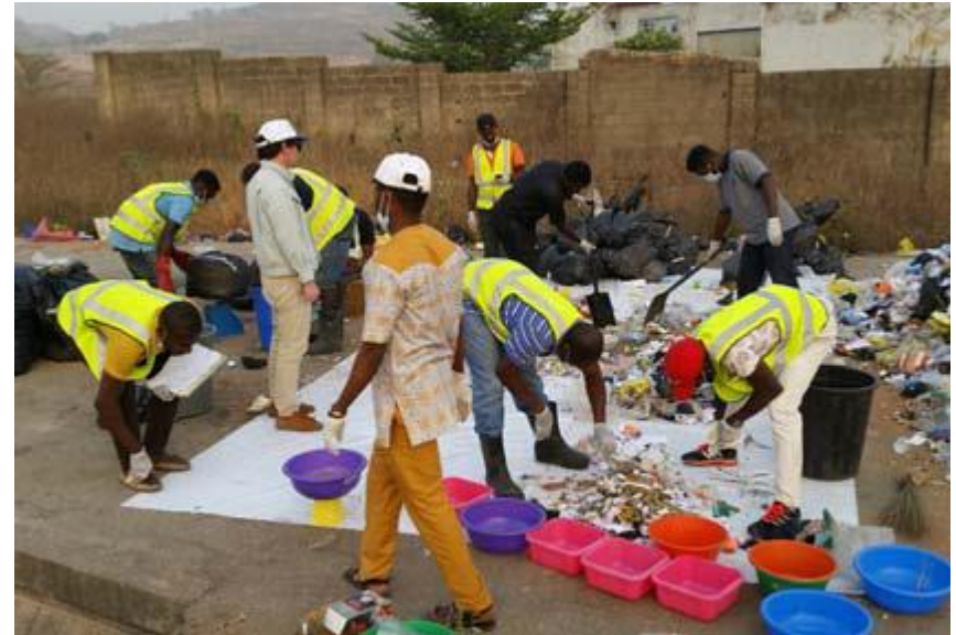
Survey on components of municipal waste